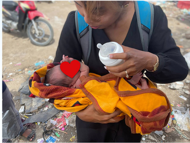
Yet another baby you helped rescue this year!