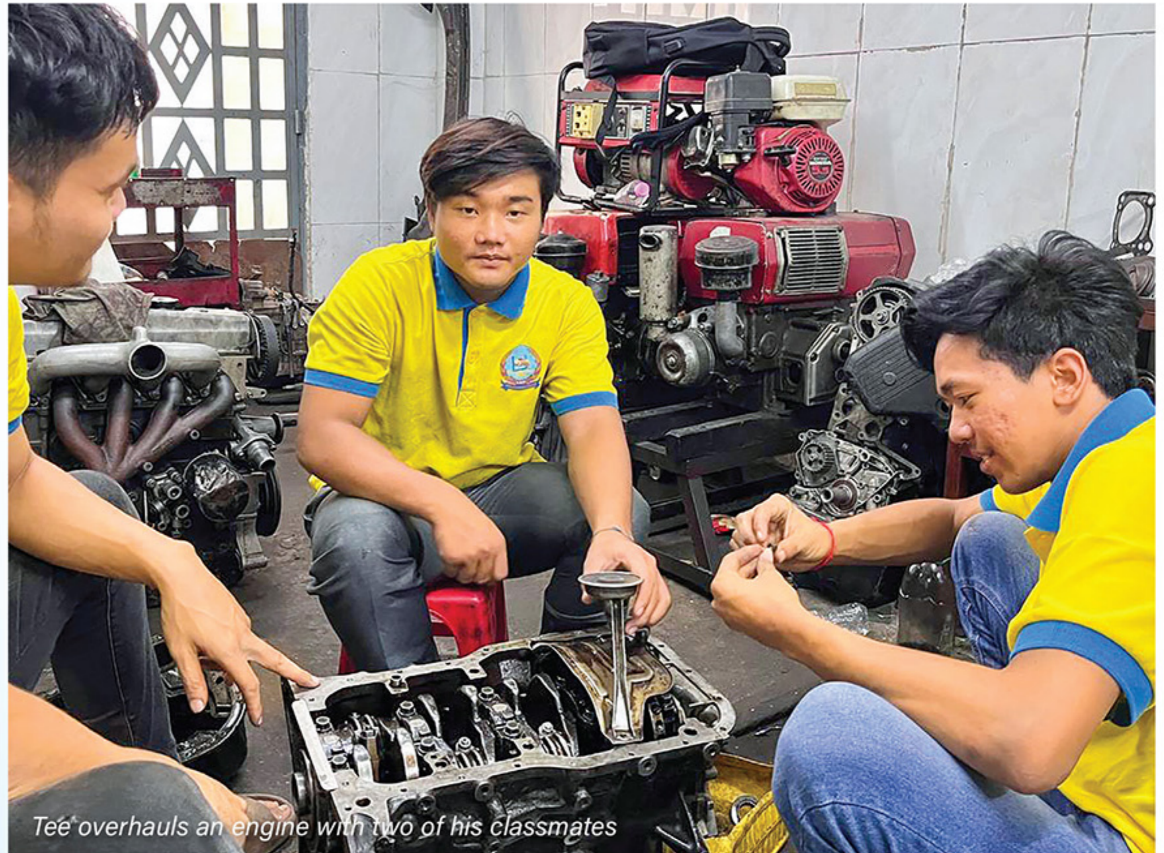
Tee* overhauls an engine with two of his classmates