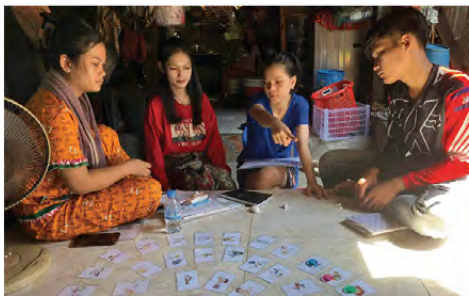
Computers, math, games—and prayer...using every method to protect and prosper EEP kids.