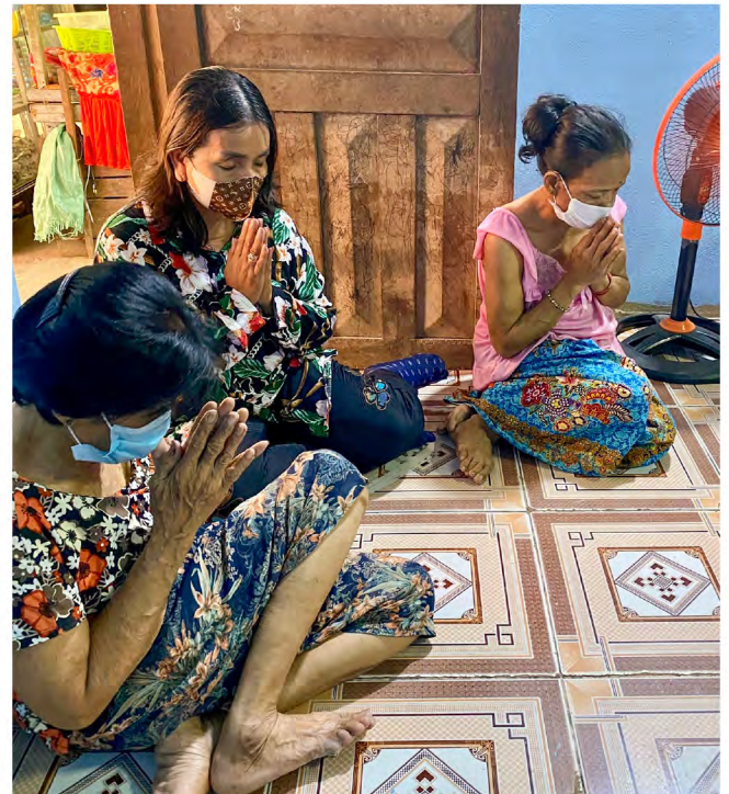
Believers praying in our new Shiloh location that you helped provide, giving us more outreach and discipleship possibilities!