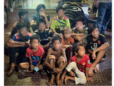
Clockwise from top: an Elijah team training; the rescued boys just after the raid; the combined team entering the brothel

This was Elijah's first "big one," but we felt ready. The night was dark, but a greater darkness permeates that part of Phnom Penh – one that blots out hope with the scourge of drugs, alcohol and illicit sex.