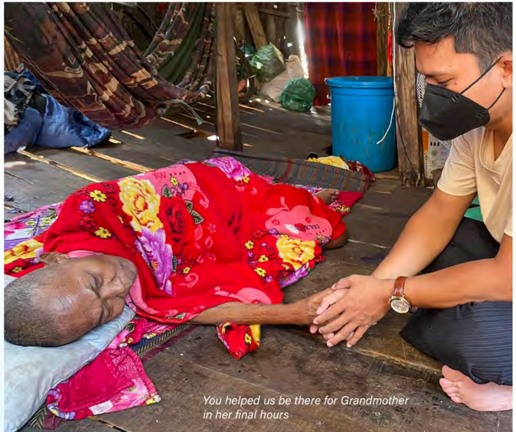
You helped us be there for Grandmother in her final hours