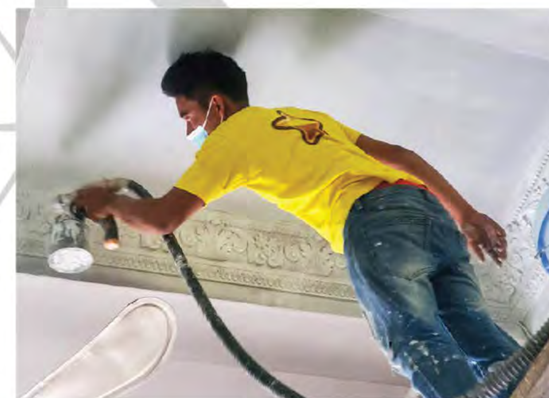
At top, early monsoon rains flooded our new Hope House in the spring, followed by fire a few weeks later that gutted several rooms and destroyed most of what had not been ruined in the flood. Generous partners like you helped us get restoration work underway.